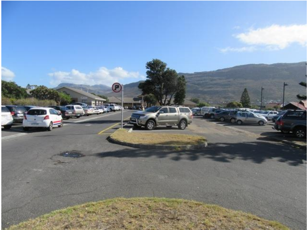
Annexure B : Proposed Monument Location